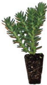
128 Cell Plug