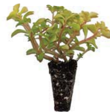
200 Cell Plug