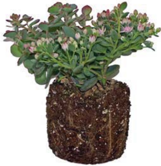
24 Cell Plug