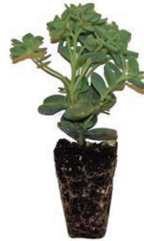
72 Cell Plug